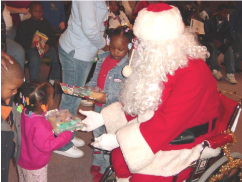
Providing holiday assistance brings joy to children who face great challenges.

Families face many conditions that reduce their quality of life. Isolation from the community resulting from caregiving responsibilities, financial hardships, lack of supports, and limited accessibility within the community makes a difficult situation even more challenging.